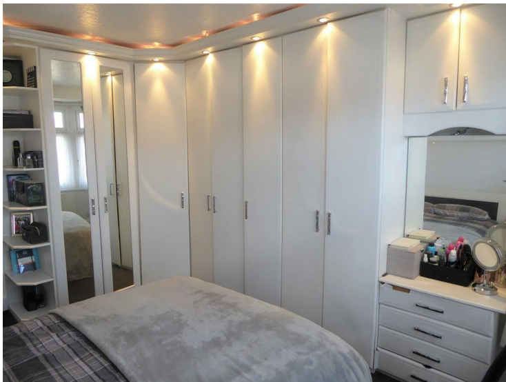
Front aspect double glazed window, radiator, wood flooring.