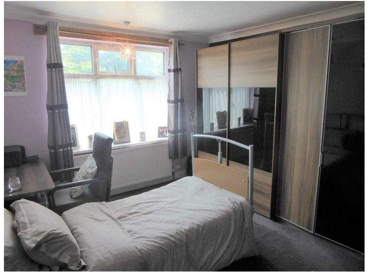
Rear aspect double glazed window, radiator, power point.