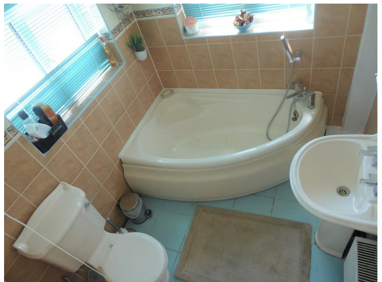
Coloured suite comprising corner bath with mixer tap and shower attachment, pedestal wash hand basin, low level w/c, tiled walls and flooring, radiator, side and rear aspect double glazed windows.