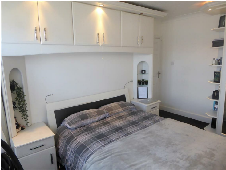
Front aspect double glazed window, built-in wall wardrobes and over bed recess with storage.